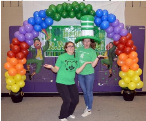
The Baldwin sisters, soon to be bald