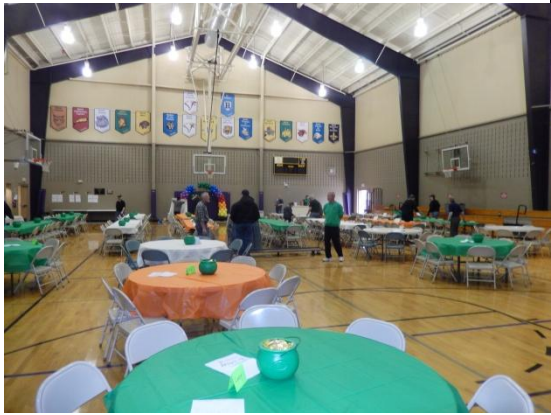
Almost Ready for the Party

work the front door, clean-up and run the bar. Please enjoy looking at one of the largest set of photos that I took during all the year's events.