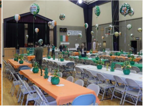
Getting Set up in the early afternoon