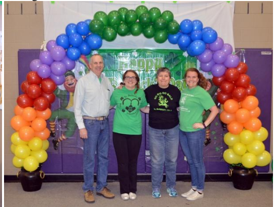
The Baldwin Family (Girls with Hair)