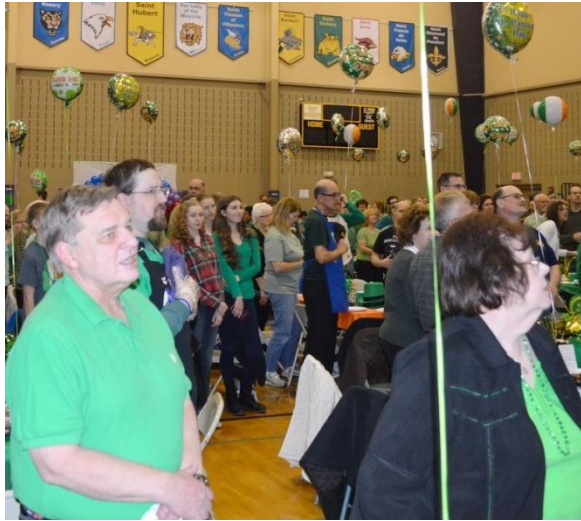
The crowd singing the National Anthem