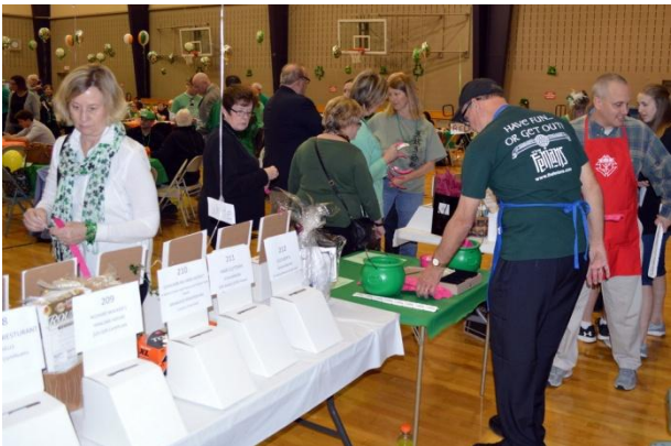
Raffle Ticket Table of Prizes