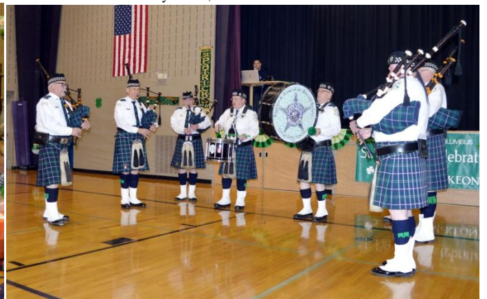
The Bagpipes & Drums of the Emerald Society