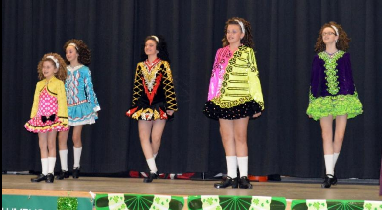
Some of the many colorful outfits on the girls!