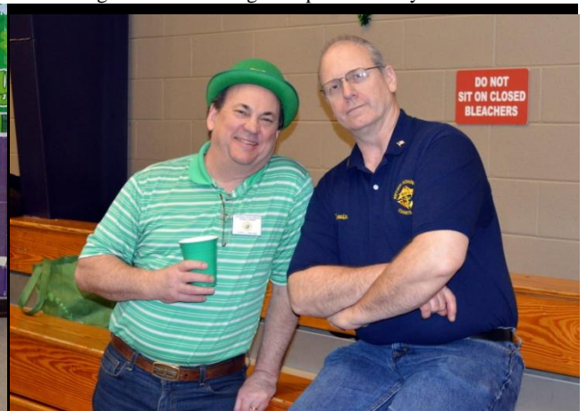
Relaxing with a beer during the party