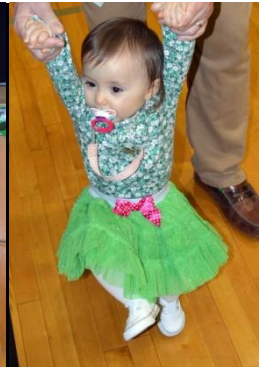
One of the smaller party goes