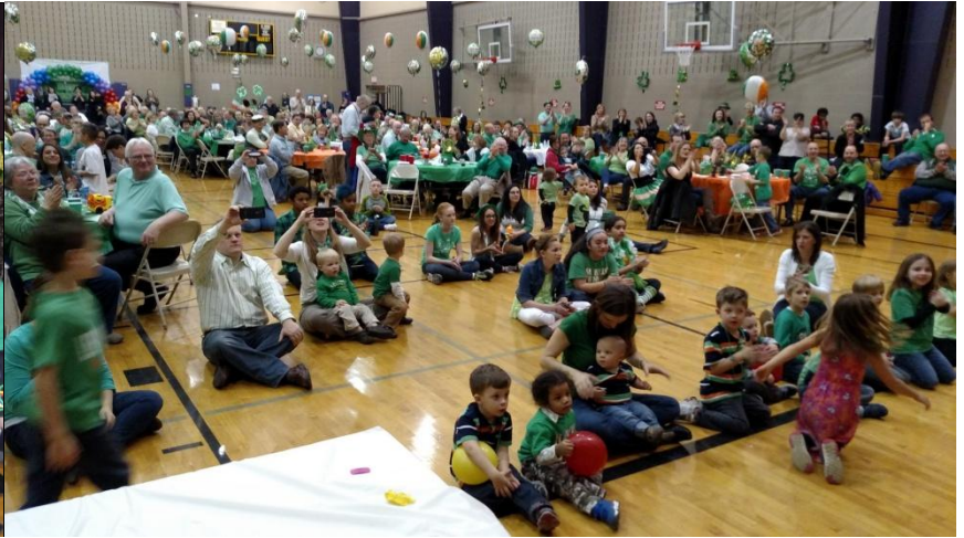
The children all watching the Trinity Dancers