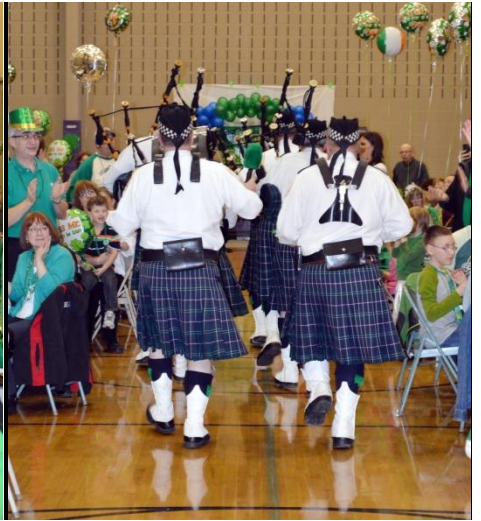
Leaving the Hall - still playing