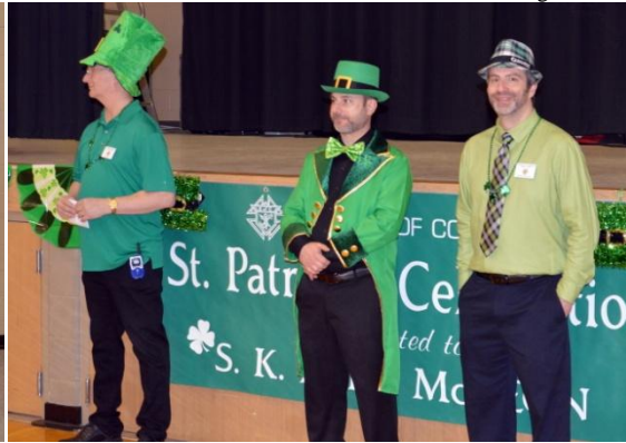
The Three lead Organizers