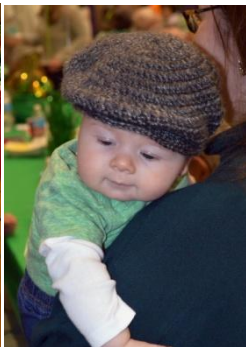
Never too young to celebrate