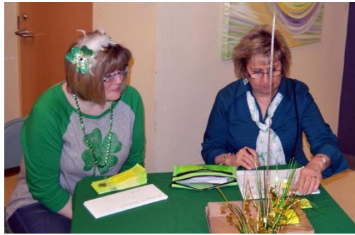
The Ladies at the front door