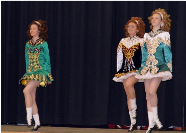
These older girls really impressed their audience