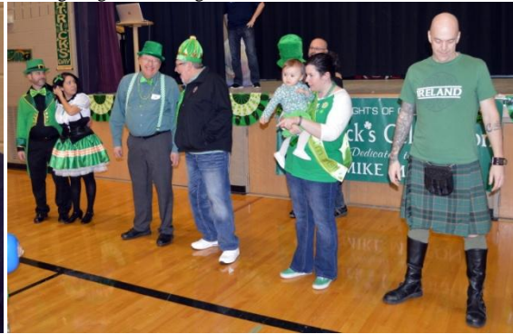
Finalists in Best Dressed Adults