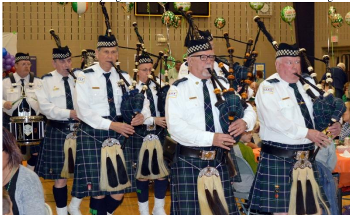
Bagpipes & drums playing as they march in