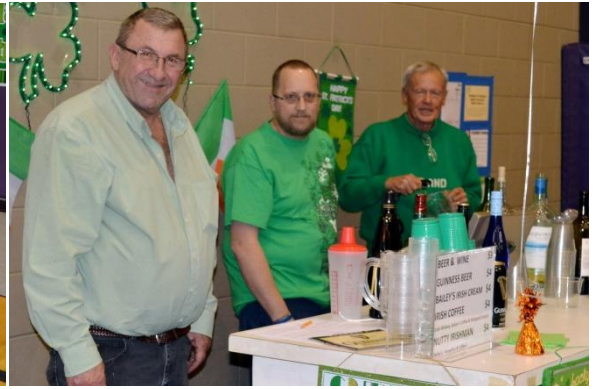
The Boys behind the Bar