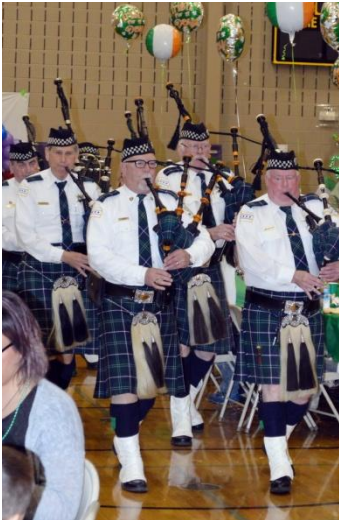
Marching and playing on the way out