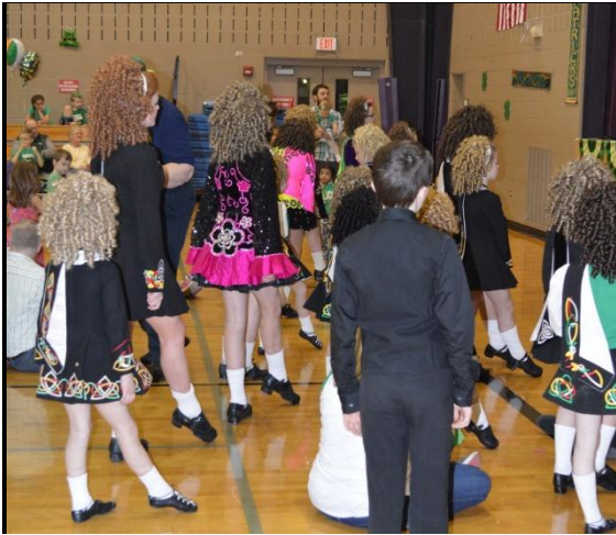
The Trinity Dancers showing us up close & personal how to dance